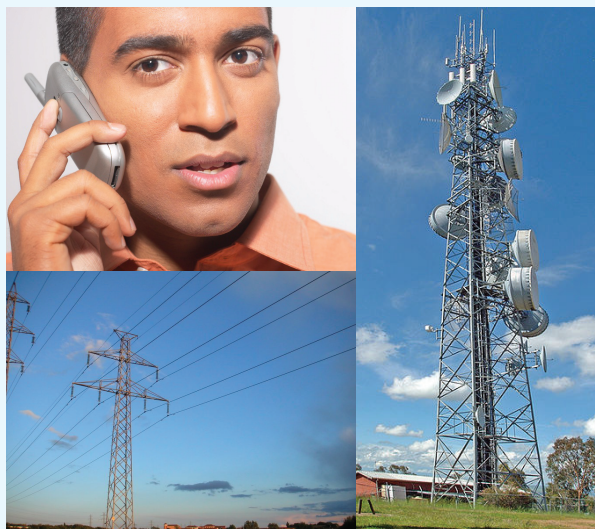
Figure TF17-1 Electromagnetic fields are emitted by power lines, cell phones, TV towers, and many other electronic circuits and devices.

Assessing health risks associated with exposure to EMFs is complicated by the number of variables involved, which include: (1) the frequency f , (2) the intensities of the electric and magnetic fields, (3) the exposure duration, whether