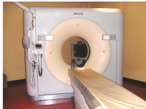
Figure TF6-2 CT scanner.