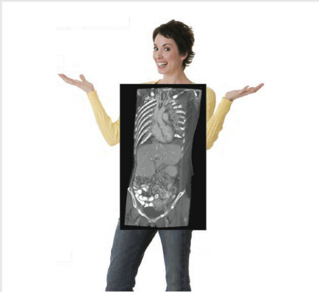
Figure TF6-1 2-D X-ray image.

A CT scanner uses an X-ray source with a narrow slit that generates a fan-beam , wide enough to encompass the extent of the body, but only a few millimeters in thickness [ Fig. TF6-3(a) ]. Instead of recording the attenuated X-ray beam on film, it is captured by an array of some 700 detectors . The X-ray source and the detector array are mounted on a circular frame that rotates in steps of a fraction of a degree over a full 360° circle around the patient, each time recording an X-ray attenuation profile from a different angular perspective. Typically, 1,000 such profiles are recorded