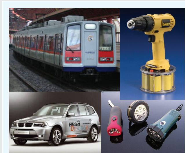
Figure TF8-2 Examples of systems that use supercapacitors.